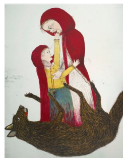
photo credit: cover, "Woods Wolf Girl" by Cornelia Hoogland. Image: "Born," by Kiki Smith

Hoogland attributes her childhood on densely wooded Vancouver Island, BC, with inspiration for her writing. Hoogland has performed and worked internationally in the areas of drama and poetry. Crow (Black Moss Press, 2011) is Hoogland's 6th book. Hoogland's poetry has been shortlisted for the CBC literary awards. Her writing in the area of Aboriginal, place-based education was recently featured in the Huffington Post. Hoogland divides her time between London, Ontario and Hornby Island, BC.