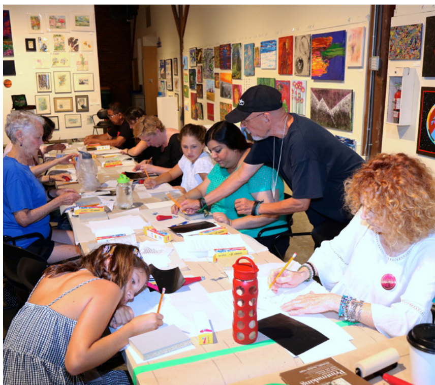
VOAF 2018 Workshop